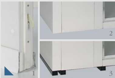
Floor 1. without floor 2. with cold room floor 3. with freezer room floor