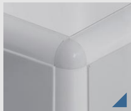
Inner rounded corners