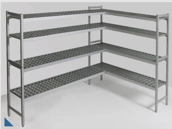
Racks with four shelves