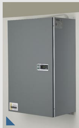
Compact cooling unit