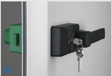
Door handle with lock and emergency release