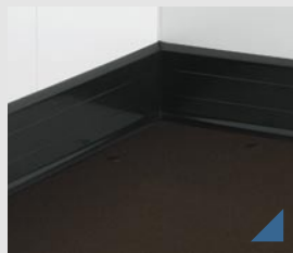
Reinforced floor 9 mm